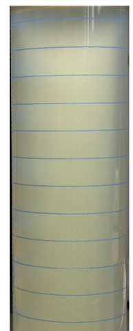
Too much yeasts with respect to the quantity of CLARIFIANT XL™